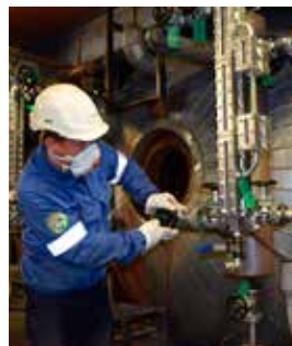
Refurbishment and upgrading of large combustion plants