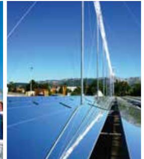
Concentrated solar power plant