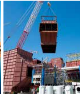
Installation of a flue-gas treatment system