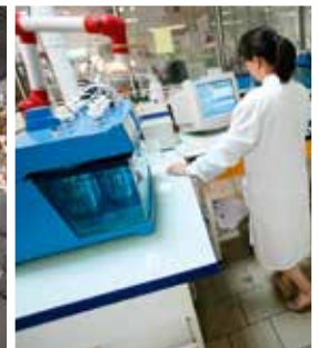
Bertin Pharma research laboratory