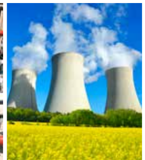
Maintenance work on nuclear power plant