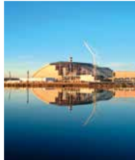
Construction and operation of a waste-to-energy plant

nuclear power and large-scale scientific instruments, defense, security and digital intelligence, consultancy and innovative engineering, industrial solutions, solutions for life sciences.