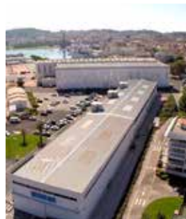
CNIM industrial site in La Seyne-sur-Mer