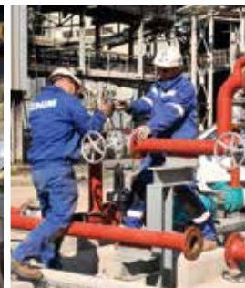
Maintenance work on thermal power plant