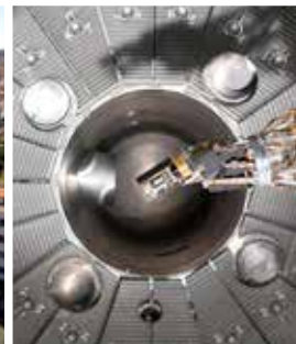
Design and production of equipment for the Megajoule Laser