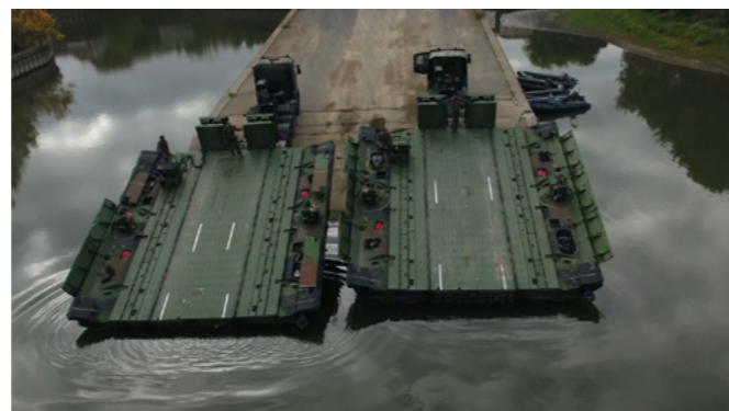
▲ 2 PFM trucks = MLC 40 ferry