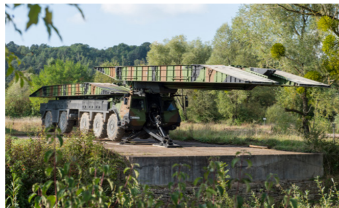
▲ Rapid operation Short bridge (14 m) in 8 min / Long bridge (26 m) in 10 min