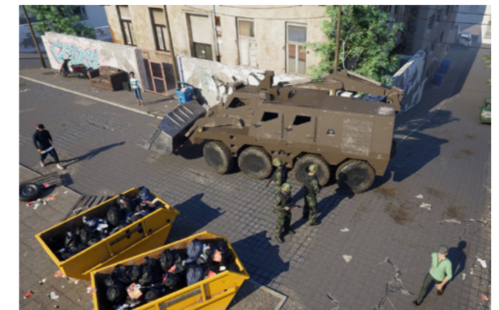
▲ Can operate in urban environments