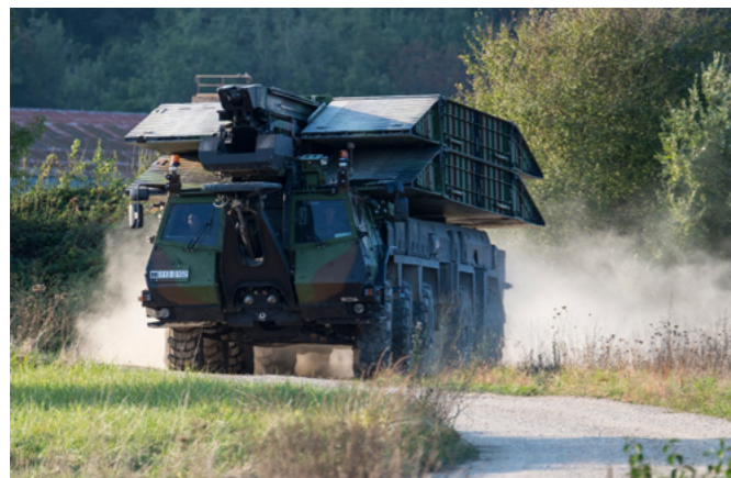
▲ MLC 85T/100W

With a top speed of 80 kph , the Modular Assault Bridge is a rapid, highly mobile off-road vehicle . It is armoured and equipped with a high-performance perimeter detection system for use in entirely automatic bridge-laying operations, ensuring that this modular assault bridge's operators remain safe.