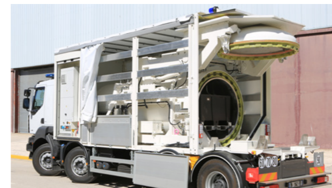
▲ Tank strength: 13 kg eq. TNT

The VTM securely transports chemical munitions dating from the First World War along normal roads to their place of storage then destruction . Designed and manufactured by CNIM Industrial Systems for the Ministry of the Armed Forces, it is equipped with a tightly sealed, armoured tank . Given the sensitivity and hazardousness of the materials transported, the VTM meets stringent safety standards . Our engineers have tested and qualified the vehicle's stability, integrity when overturned, mechanical strength, etc.