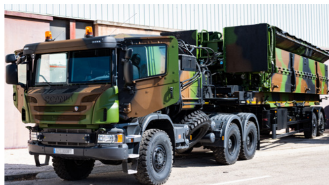
▲ 22 articulated trucks delivered between 2018 and 2021

These adaptations include armoured cabs providing greater operator protection. In addition, short ramps have been integrated into the sections to reduce their logistical footprint.