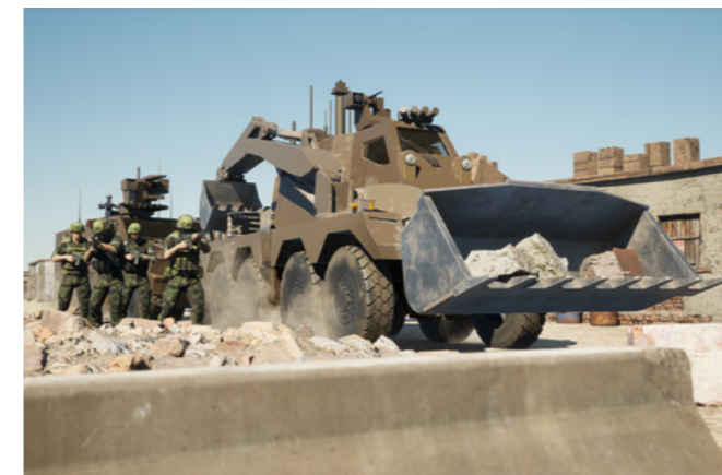
▲ Clearing-up operations in areas of highly intense fighting

The EGC is a mobility and counter-mobility vehicle providing support for the Armed Forces during operations. It is a multifunction land development vehicle adapted to a variety of tasks: engineering works, support for ground forces, etc. The EGC has a 600 km range and a top speed of 80 kph. Being highly mobile, armoured and armed , the EGC protects the military personnel even in areas of highly intense combat. The EGC is equally suited for use in conflicts and natural disasters in clearing rubble and roads.