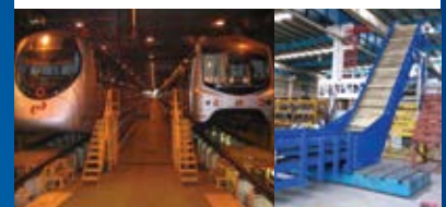
Operating Train Door Systems