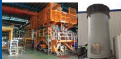
Spent Fuel Cask Transfer Facility