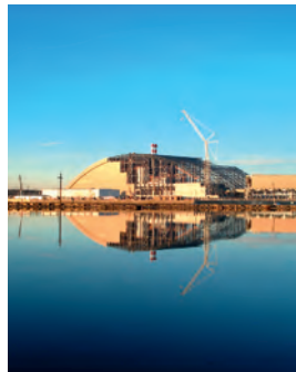
Construction and operation of a waste-to-energy plant