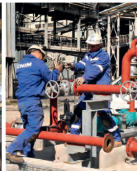
Maintenance work on a thermal power plant