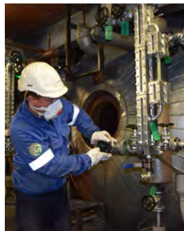
Refurbishment and upgrading of large combustion plants