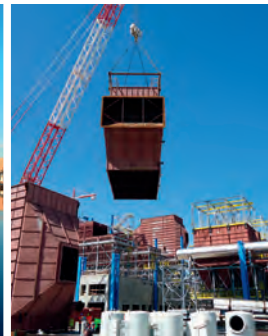
Installation of a flue-gas treatment system