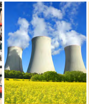
Maintenance work on a nuclear power plant