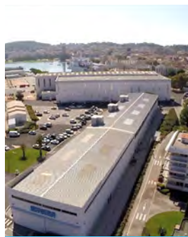
CNIM industrial site in La Seyne-sur-Mer