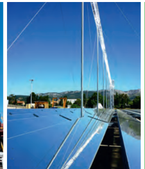
Concentrated solar power plant