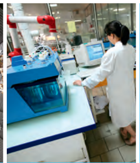
Bertin Pharma research laboratory